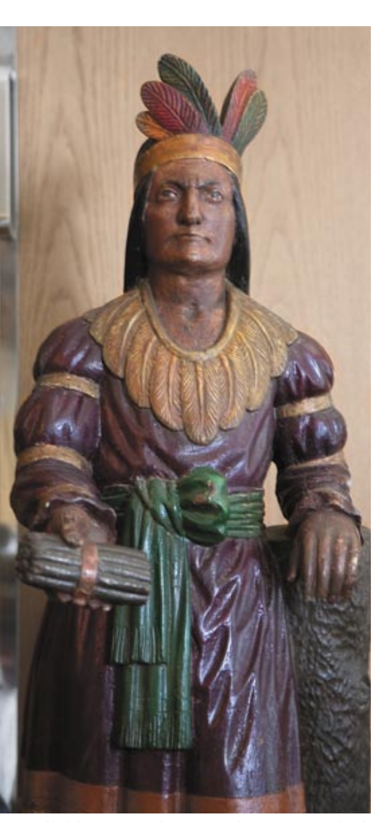
Dubbed "leaners," some Indians were carved resting an arm on a barrel, an oversized cigar, or a tree stump, as shown in this statue created by Thomas V. Brooks of New York.